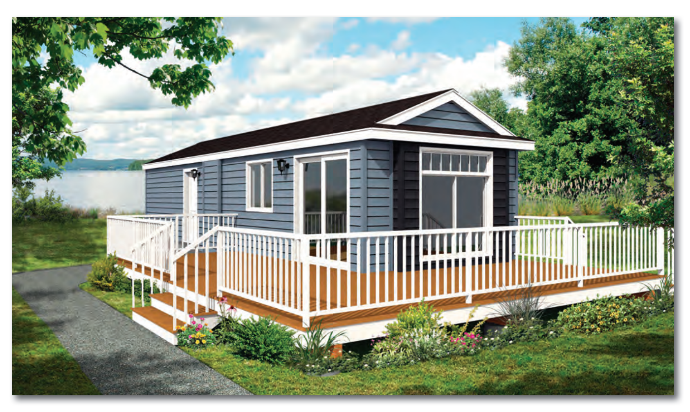
2 BDRM, 1 BATH, GALLEY KITCHEN | 13'x40'6" | 536 sqft | 13PM40601